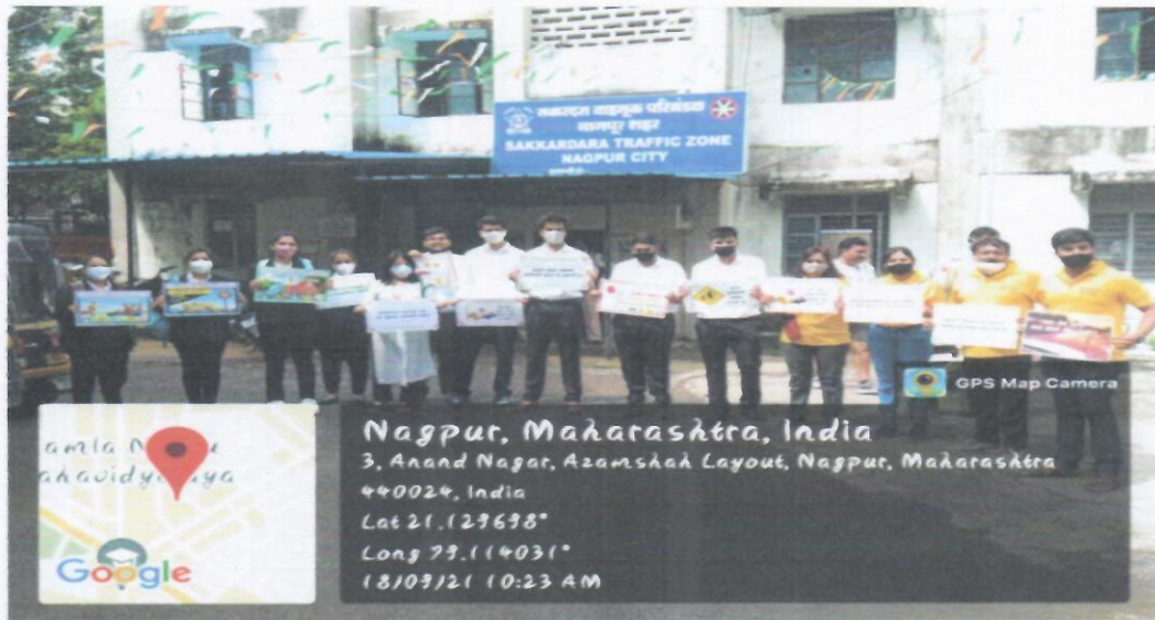
Students of SLS, Nagpur and members of NGO displaying posters relating to the traffic rules.