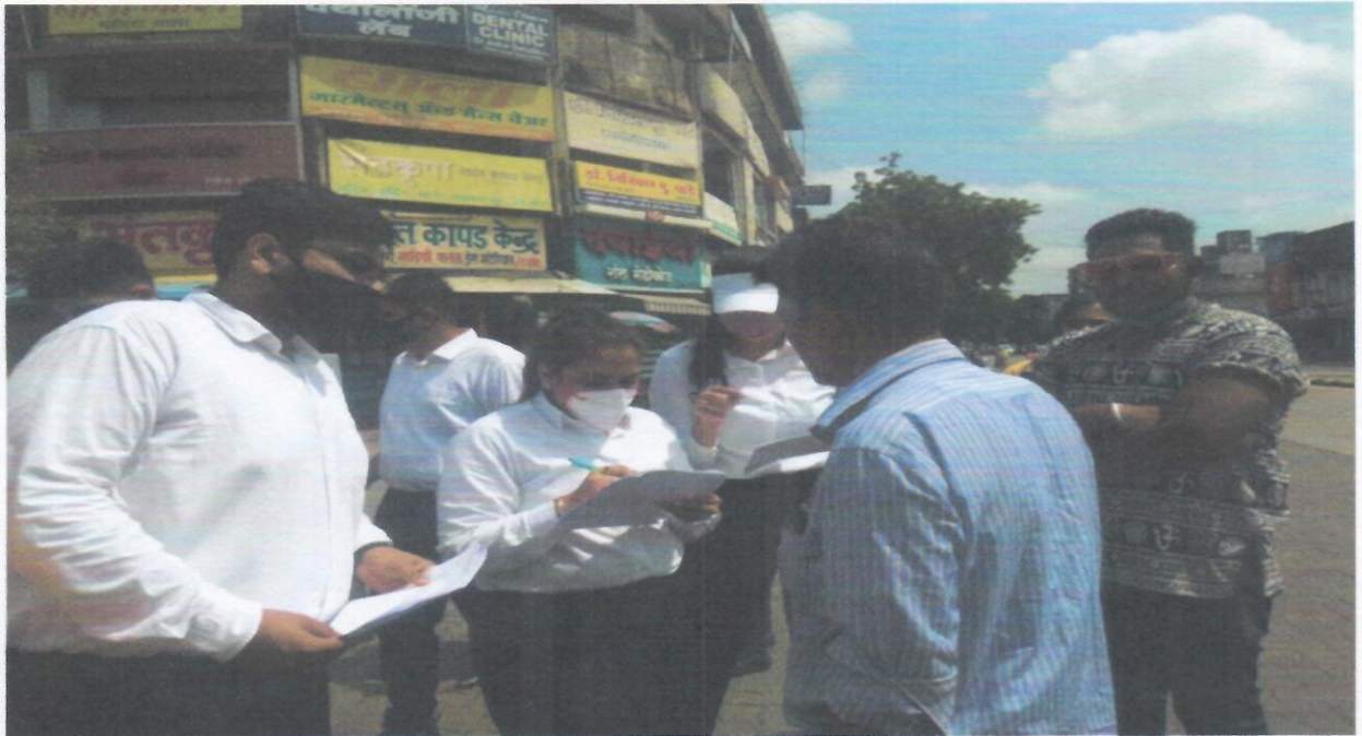
Students interacting with the pedestrians.